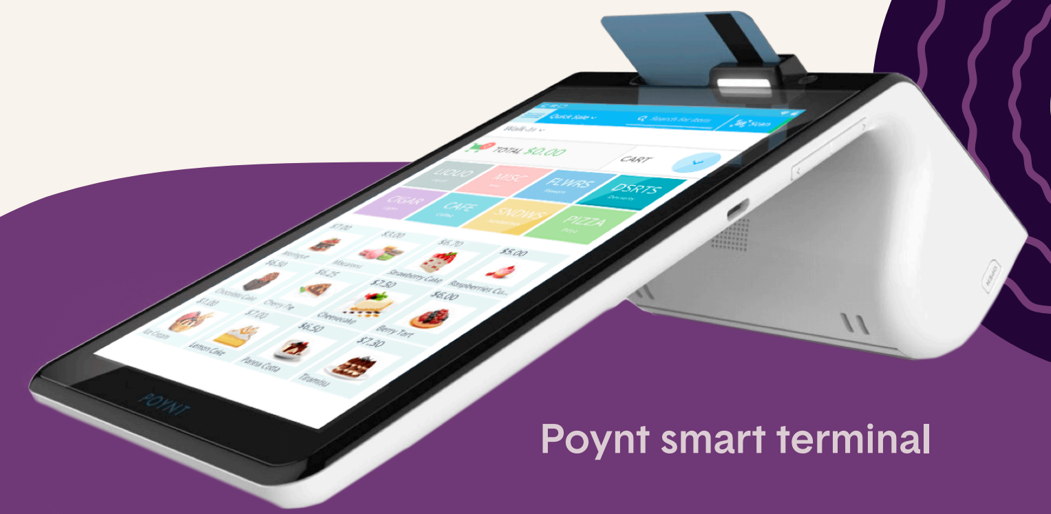
Poynt smart terminal